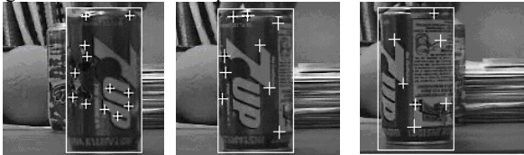
Figure 1. Sequence with self occlusion. (50 particles, 120fps). Frames 1, 200, and 350.

false Alarm Rate (FAR) = FP / (FP + TP) , where TP is the number of true positive pixels, FN the false negative and FP the false positive pixels. The target area was defined by a bounding box. In Table 1 we show the results on several sequences compared to the particle filter that uses edges and histogram. Because of the challenging nature of the selected sequences the classical particle filter using only edge information always failed after a few frames and thus is not included in the results. The ‘caviar’ sequences mentioned on Table 1 are taken from CAVIAR project [17] (corridor view from the Shopping Center), which provides ground truth. The nature of the data didn’t allow the tracking of many salient points; therefore our method only slightly outperformed the other. The ‘tennis’ are challenging sequences similar to that of Figure 2. The ‘cars’ are sequences taken from traffic cameras.